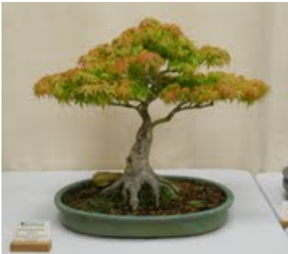
Kyo-Hime Japanese Maple