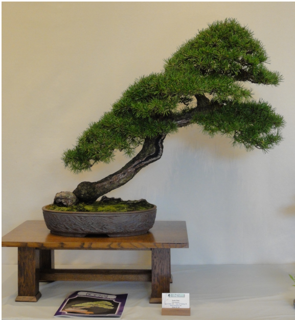
Scots Pine By Cyril Grum